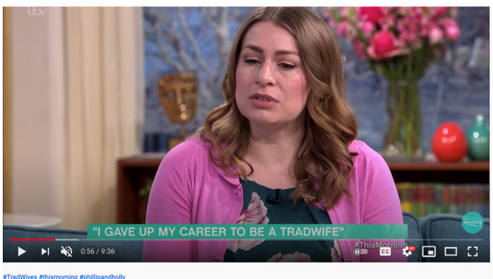
The Woman Who Would Rather Obey Her Husband Than a Boss | This Morning Figure 4. Youtube archive of a morning tv show that celebrates the #Tradwife movement

Online they echo these talking points, sharing memes that submitting to one husband is better than submitting to 10 bosses, or making videos about how much happier they are as they gave up lonely careers in finance to marry true masculine men. They share makeup tips and dress styles to increase femininity, and with them, farther right talking points. Some also use this gender role to support a racist, pronatalist, illiberal politics that would deny women the vote in a new white nation state.