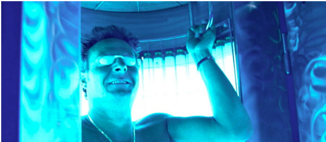
Figure 4. The Camorra avenger in the opening sequence of Gomorrah .

cult of beauty of the Camorra (some of them are having a manicure), and in retrospect we realize that a dark irony permeates them, since later in the film we learn that these people live in a territory devastated by toxic waste. The use of blue light is an evident homage to Blade Runner , in which Scott often adopts a soft frontlight (sometimes a soft uplight with a hard backlight) in order to create its celebrated silhouettes and chiaroscuro effect (Bukatman 1997:29). Soon, the neomelodic Neapolitan music in the background (“Our story seems like a TV animation” coherently goes the song) is covered by the sound of several gunshots. The avenger and his accomplice flee, while the image of the hyperrealist dead bodies lingers until the title of the film appears in purple against a black background. This reproduces the colors of Andy Warhol’s Knives that appear on the cover of the Italian edition of the book. In both Saviano and Garrone’s works, narrative complexity is mixed with a critical absorption of pop art/culture.