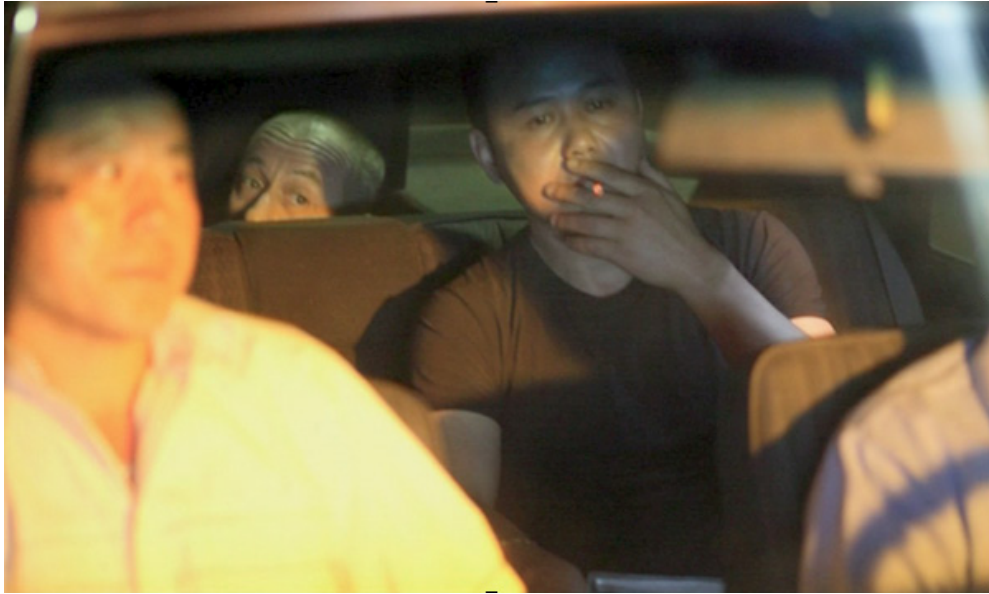
Figure 1. Xian and the Chinese driving the tailor Pasquale to an illegal factory.

A notable absence in the adaptation is that of Saviano's persona and his narrative "I" that emerges in many introspective chapters of Gomorrah , which could have been easily adapted in the film as a voice over. As Jameson pointed out in "Synoptic Chandler:"