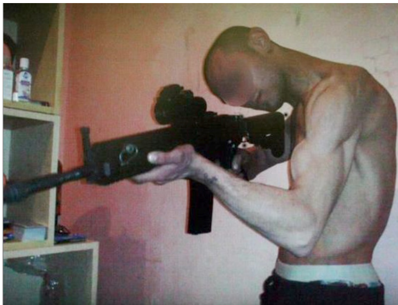
Figure 2-3. Life imitates cinema even when it comes to Gomorrah . Two cellular phone portrayals of a member of the Quarto Oggiaro gang.