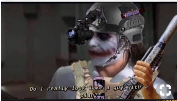
Figure 2. Meme shared on Facebook Boogaloo Bois groups. (2020, author anonymous).

When you and the boys go full boogaloo and baptize all the politicians at the capital building and now it's completely surrounded by the National Gaurd and you can hear Seal Team 6 Roping in on the roof and the boys are asking you what to do now.